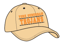
Item 17 Cotton Hat Off White Adjustable $10