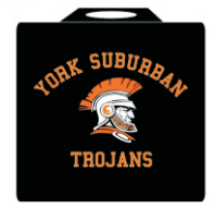
Item 26 Stadium Seat Cushion Black $10