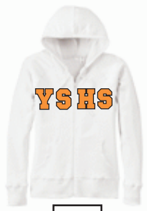
Item 4 Ladies Full Zip Hoody White S-2XL $24