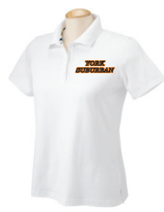
Item 12 Ladies Polo Shirt White S-2XL $20