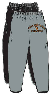
Item 10 Open Leg Sweat Pant Gray or Black Youth M-L & Adult S-2XL $20