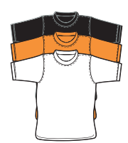
Item 22 Short Sleeve T-shirt Black, Orange, or White Youth M-L & Adult S-2XL $10