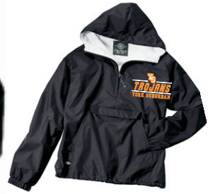
Item 6 Pullover Jacket Black S-3XL $30