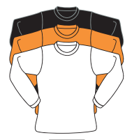
Item 21 Long Sleeve T-shirt Colors: Black, Orange, or White Youth M-L & Adult S-2XL $12