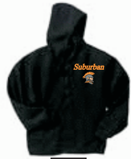
Item 5 Mens Full Zip Hoody Black or Orange S-2XL $28