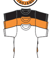
Item 23 Short Sleeve T-shirt Black, Orange, or White Youth M-L & Adult S-2XL $10