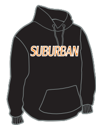
Item 20 Hooded Sweatshirt Black S-2XL Embroidered $30 Screen Printed $25