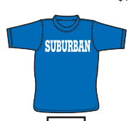
Item 29 Short Sleeve T-shirt Royal Youth M-L & Adult S-2XL $10