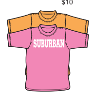
Item 28 Ladies Short Sleeve T-shirt Pink or Mango Youth M-L & Adult S-2XL $10