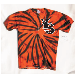
Item 24 Tie Dye T-shirt Orange/Black Youth M-L & Adult S-2XL $15