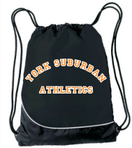
Item 9 Sports Pack Black $10