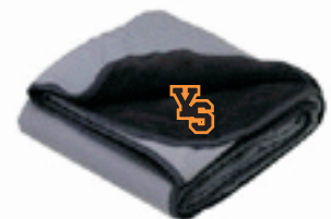
Item 8 Fleece/Nylon Stadium Blanket Black/Gray $25