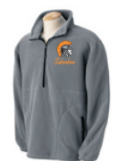
Item 30 Polar Fleece Pullover Gray Adult S-2XL $30