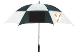
Item 1 Umbrella Black/White $20