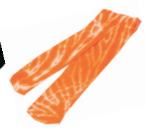
Item 7 Tie Dye Socks Orange $8