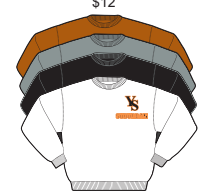
Item 27 Crewneck Sweatshirt Black, Texas Orange, Gray, or White $20