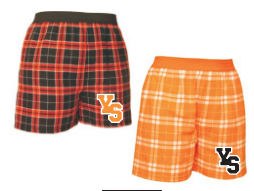
Item 2 Flannel Boxer Shorts Orange/White or Black/Orange Youth M-L & Adult S-2XL $10