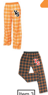
Item 3 Flannel Pajama Pants Orange/White or Black/Orange Youth M-L & Adult S-2XL $18