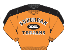
Item 13 Crewneck Sweatshirt Orange or Black S-2XL Embroidered $25