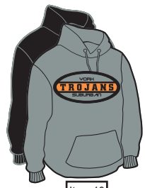
Item 19 Hooded Sweatshirt Gray or Black S-2XL Embroidered $30 Screen Printed $25