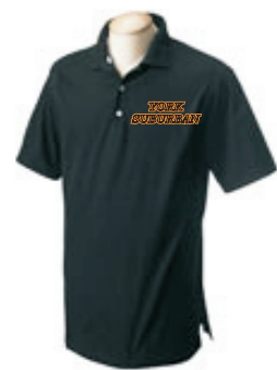
Item 11 Mens Polo Shirt Black S-3XL $20