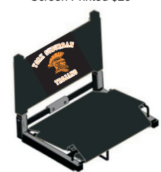
Item 25 Stadium Chair Black Canvas $28