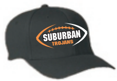
Item 18 Flexfit Hat Black S/M or L/XL $12